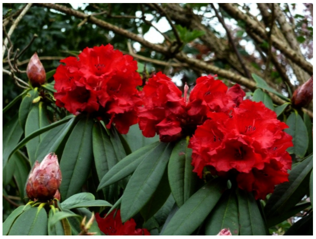
R. Taurus, one of the best red rhododendrons

For instance, I believe rhododendrons appeal more to men than women, especially red rhodos. If you sent a man into a garden