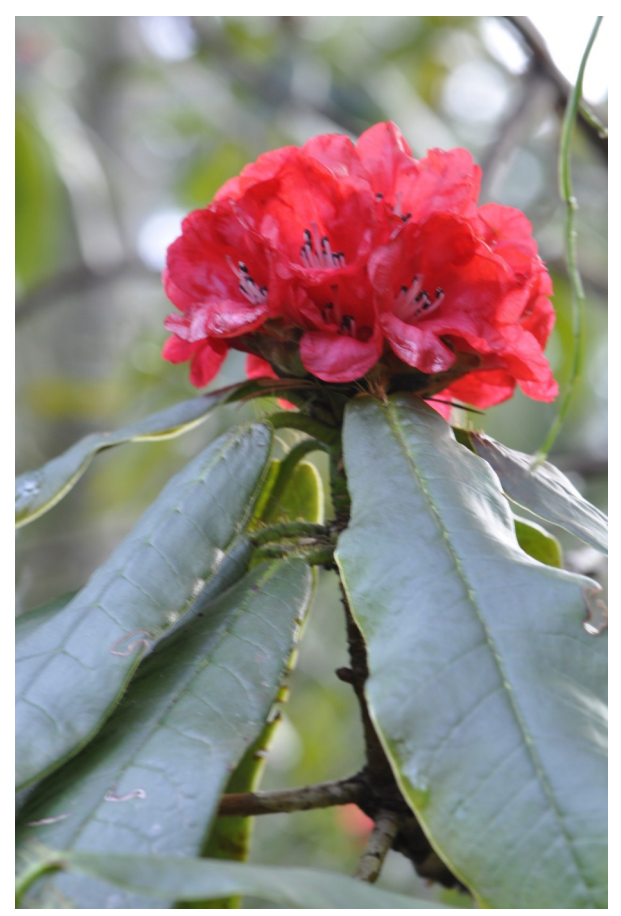
R. Strigilosum, in all its armoured glory has indumentum under its leaves, and rich red blooms making it the perfect rhododendron for a male gardener.