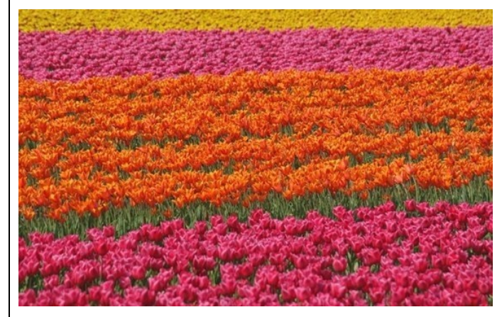
Tulip fields in the Netherlands

No trip to the Netherlands would be complete without views of millions of tulips bulbs in bloom. Unlike gardeners here in Victoria, the gardeners there do not have to fight with squirrels and deer. There aren't any.